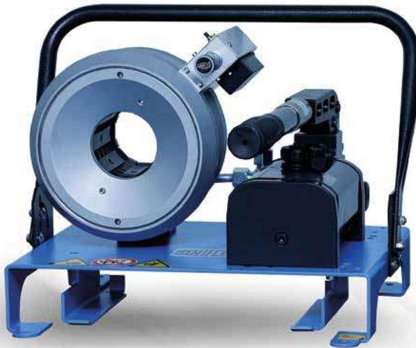
SH 2 MH 2

The SH 2 series models offer an optimal force-to-weight ratio of 1" 4 SP at a weight of 29 kg, a large opening stroke up to 22 mm (0.87") and a maximum pressing range up to 63 mm (2.48").