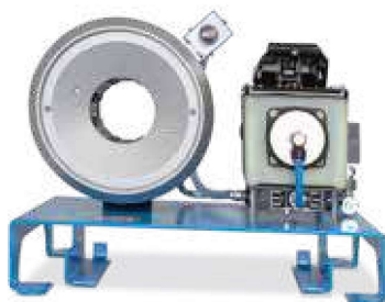
SH 2 P