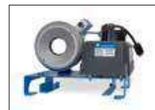
SH 2 DC

PUM 0.8/3.2-700 bar. The mobile high pressure unit achieves 700 bar: a real magic box!