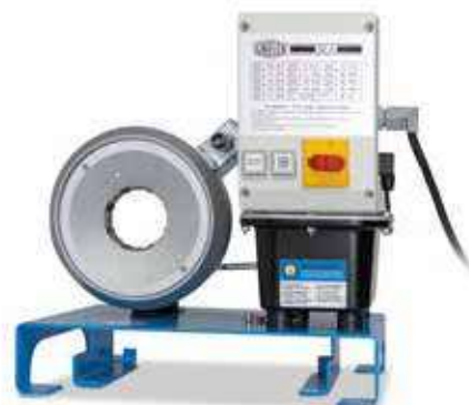
SH 2 A