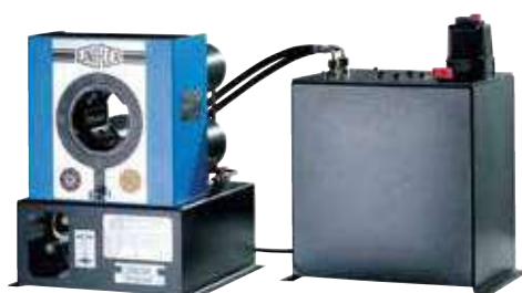
HM 200 Ecoline