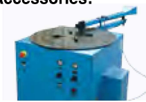
Coilers Page 11