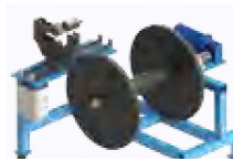
Reelers Page 10