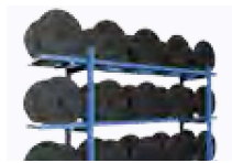
Dispensing Racks Page 10