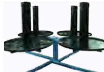
Platters Page 10