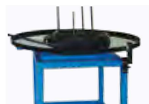
Payouts Page 9