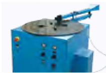
Coilers Page 11