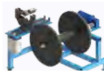
Reelers Page 10