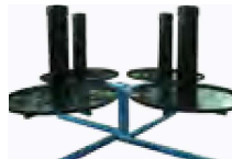
Platters Page 10