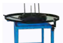
Payouts Page 9