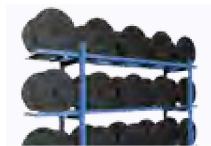
Dispersing Racks Page 10